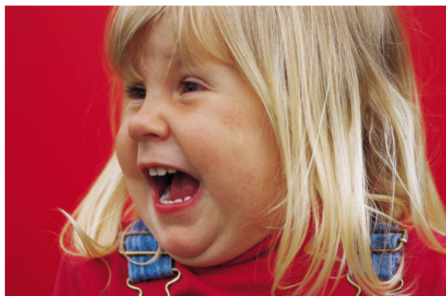
He who gives to me teaches me to give. --Danish Proverb