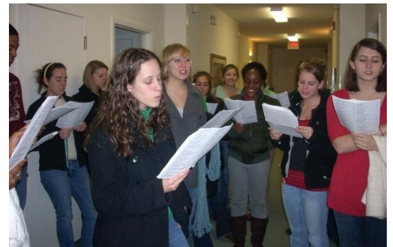
UNC-Chapel Hill's Circle K members go Christmas caroling for the residents at the Shepherd House.